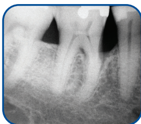
6 Years Post-LANAP® Protocol